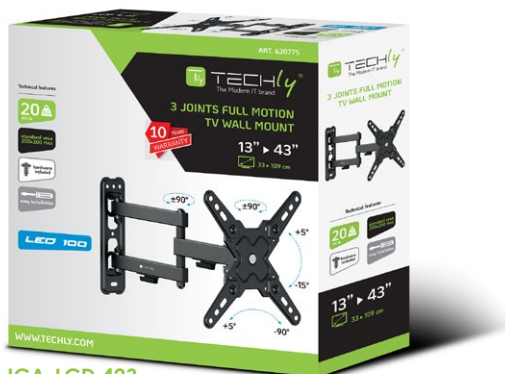
ICA-LCD 423 pack